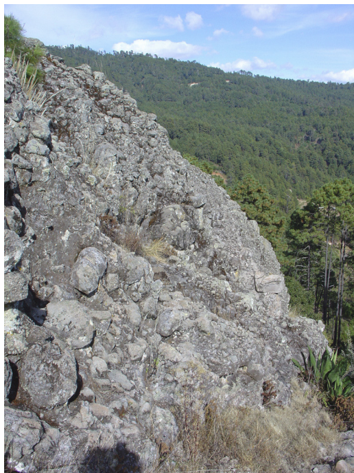
Figure 1. Habitat of Echeveria longissima subsp. brachyantha at La Muralla.

20 of the 49 species known for the state. 28% are strictly endemic species to the area (Reyes, unpublished data). This makes the Mixteca the region richest in species and endemism, not only of the genus Echeveria but also of other groups of vascular plants (García-Mendoza, et al. , 1994).