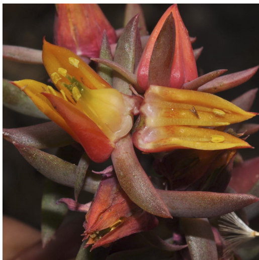
Figure 10. Flower structure of Echeveria nuyooensis .

the leaves of the floral stem. Pedicels 2.7–6 mm long, 2–3 very unequal bracteole bracts, subulate, reddish, sometimes positioned between the calyx segments, the larger ones appressed to the flower. Calyx discoid, 14.5–24 mm in diameter (extended). Sepals unequal, the small ones 4.3–6.7 mm long, ca. 1 mm wide, subulate, the largest ones 8.1–11.6 mm long, 1.8–2.2 mm wide, cuspidate, subulate, extended, sometimes ascending, green to reddish-green. Corolla cylindrical, pentagonal, 12.1–12.7 mm long, 6.5–7.5 mm wide close to the base, bright pink with yellowish hues, yellow on the inside. Petals lanceolate, slightly united at base, imbricate, acute and apiculate, 2.8–4 mm wide, ventrally channeled and keeled dorsally; nectar chamber very small, ca. 1.5 mm wide. Filaments yellow-greenish, base whitish, epipetalous 4.1–5.6 mm long, antisepalous stamens 4.9–6.3 mm long, opening after anthesis, anthers yellow. Nectaries white, reniform, ca. 2.4 mm wide. Gynoeceum 3.6–4 mm long, 3.5–5 mm wide at base, ovary yellowish, base pink, styles green, 1.7–2 mm long, stigma green.