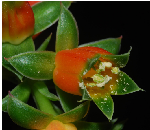
Figure 4. Flower of Echeveria longissima subsp. brachyantha .

The markedly short and pentagonal flowers of Echeveria longissima subsp. brachyantha clearly distinguish it from E. longissima var. longissima and E. longissima var. aztatlensis Meyer of series Longistylae , both of which have almost 50 mm long flowers. Table 1 shows features of the three taxa in compari-