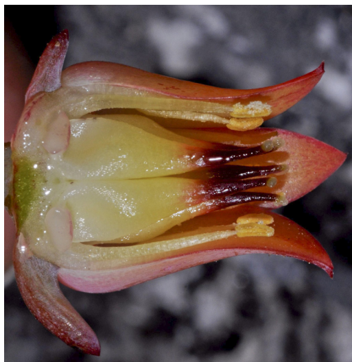
Figure 14. Floral structure of Echeveria triquiana .

Vegetation type: Secondary vegetation originally pertaining to the cloud forest. The new species