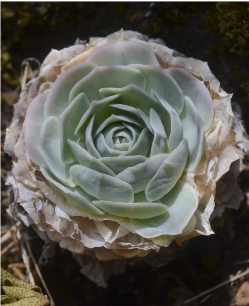
Figure 16. Echeveria ublii subsp. coelestis with dried leaves at the base of the rosette.

Tabacón, 3.5 km northwest of San Pedro Nopala, 2400 m, January 22, 1995, J. Reyes & Guillermo Moreno , 3611-A (Holotype: MEXU).