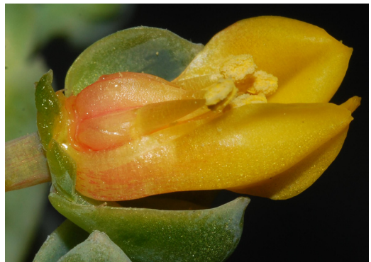
Figure 19. Floral structure of Echeveria ublii subsp. coelestis .

losum Rose, and Dahlia pteropoda Sherff are the predominant species.