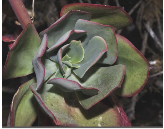
Figure 8. Rosette of Echeveria nuyooensis .