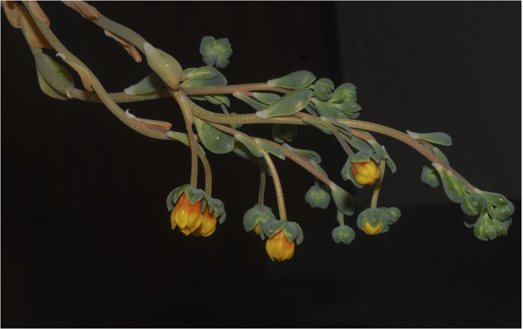
Figure 17. Inflorescences of Echeveria ublii subsp. coelestis .