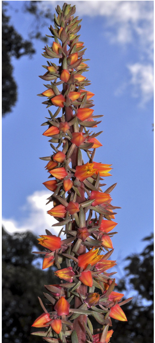
Figure 9. Thyrsoid inflorescence of Echeveria nuyooensis .