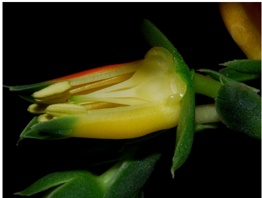
Figure 5. Ovaries and nectaries of Echeveria longissima subsp. brachyantha .