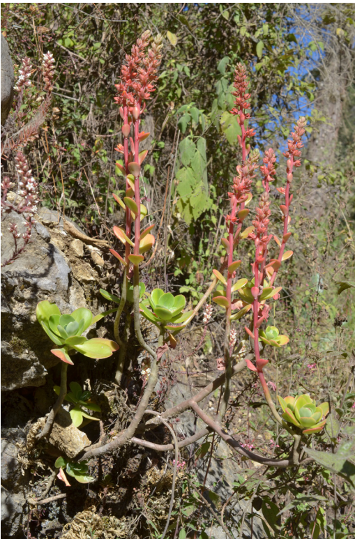
Figure 7. Flowering Echeveria nuyooensis in habitat.