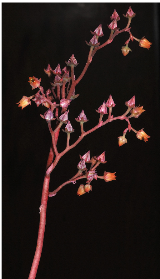
Figure 12. Flowering stem of Echeveria triquiana .

Plant glabrous. Root fibrous. Stem erect, simple, up to 11 cm tall, 2–2.8 cm in diameter. Rosettes compact, 24–30 cm in diameter. Leaves narrowly obovate to spatulate, mucronate, bluish-green to reddish-green, margin reddish, entire to frequently crenulate, extended to ascending, 12–15 cm long, 5–7.5 cm wide. Flowering stems erect, 1–2 per rosette, pinkish, 30–70 cm tall (including inflorescence), 6.5–7 cm thick close to base, with ca. 11 leaves distributed along the stem, the ones close to the base resembling the leaves of the rosette, 1–5 cm long, 0.5–1.5 cm wide, oblancoate-lanceolate, reddish. Inflorescence paniculate, 4–5 cincinni with 6–8 flowers each; bracts lanceolate and appressed each branch, 5–10 mm long, 3–4 mm wide, lanceolate, secondary bracts tiny, lanceolate. Pedicels 8–10 mm long, 1.3–1.5 mm thick, pinkish. Sepals unequal, ascending, deltoid-triangular, 3.4–6.8 mm long, 1.5–2 mm wide, reddish-green, apex acute. Corolla urceolate-pentagonal, 10–11 mm long. Petal segments lanceolate, slightly reflexed at apex, orange-pink on the outside, yellow on the inside, pink margin. Filaments yellowish, epipetalous ca. 3.5 mm long, anti-