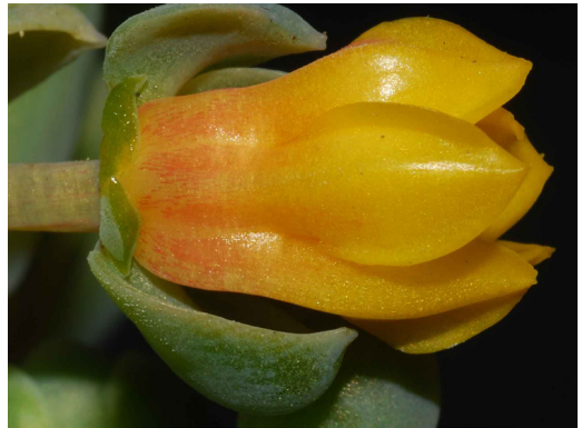
Figure 18. Flower of Echeveria ublii subsp. coelestis .

Distribution and habitat: Echeveria ublii subsp. coelestis is only known from the type locality in a steep and rocky ravine. Quercus laeta Liebm., Q. castanea Née, Furcraea longaeva Karwinsky & Zuccarini, Agave aff. ghiesbreghtii Lemaire ex Jacobi, Sedum toru-