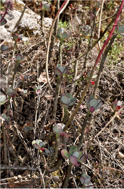
Figure 6. Echeveria nuyooensis in habitat.