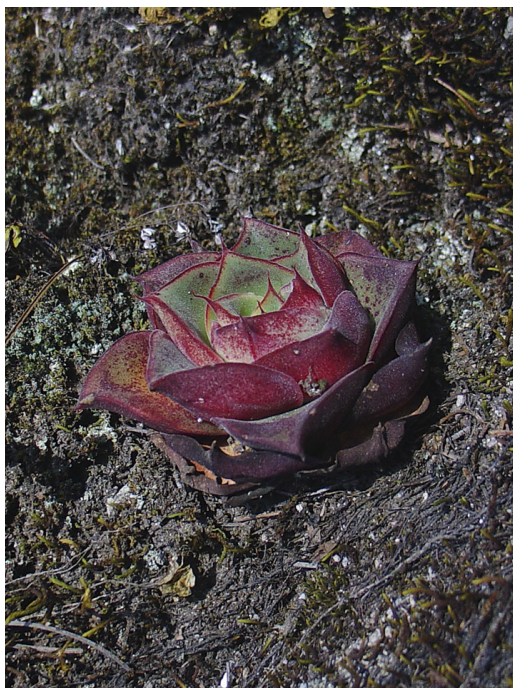
Figure 2. Rosette of Echeveria longissima subsp. brachyantha in habitat.

Plant glabrous. Stems erect, up to 5 cm tall, 1.5 cm thick, occasionally branching by stolons, not evident. Rosette 8–11 cm in diameter, 16–25 leaves. Leaves obovate, upper surface concave, apex mucronate, 4–7 cm long, 2.5–3 cm wide, green with shades of reddish, extended, the leaves in winter slightly papillose, ascending. Flowering stem erect, 15–28 cm tall with elliptical-oblongate, acute, as-