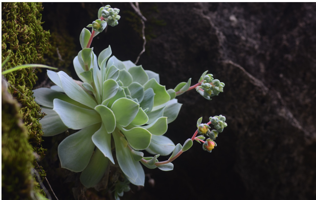
Figure 15. Echeveria uhlii subsp. coelestis in habitat.