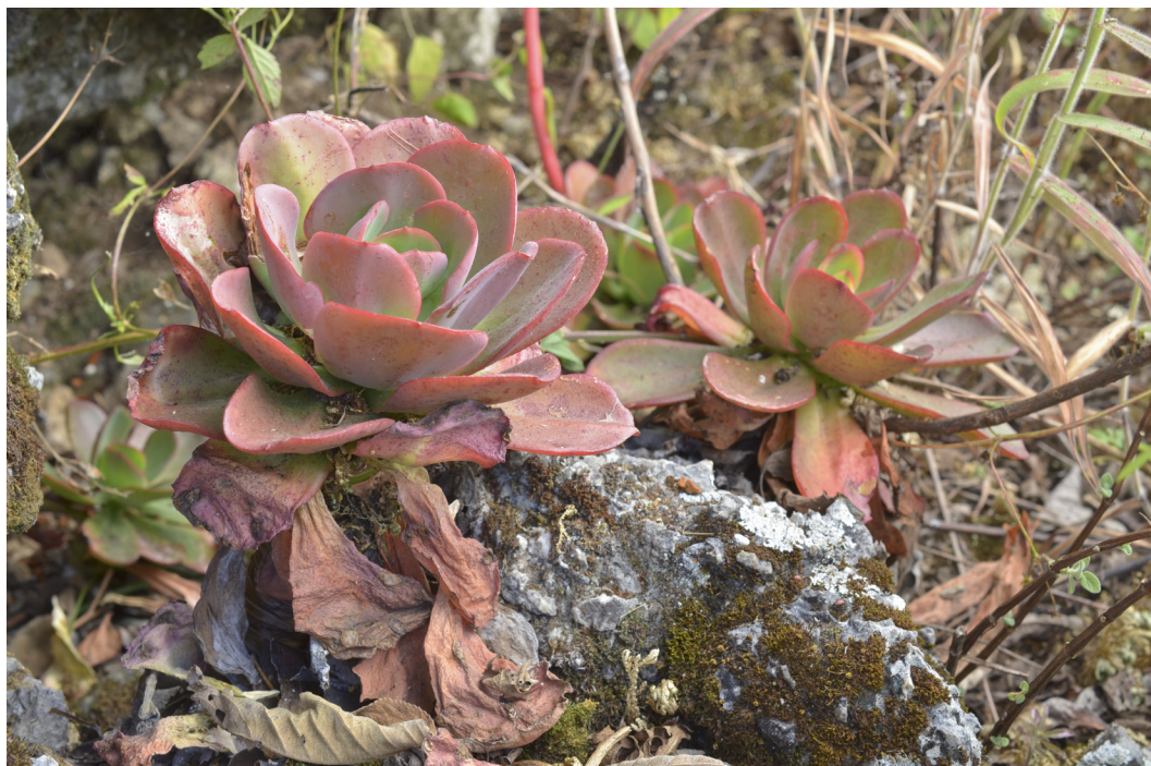
Figure 11. Echeveria triquiana in habitat.

Echeveria triquiana Reyes & Brachet sp. nov. (Figs. 11–14)