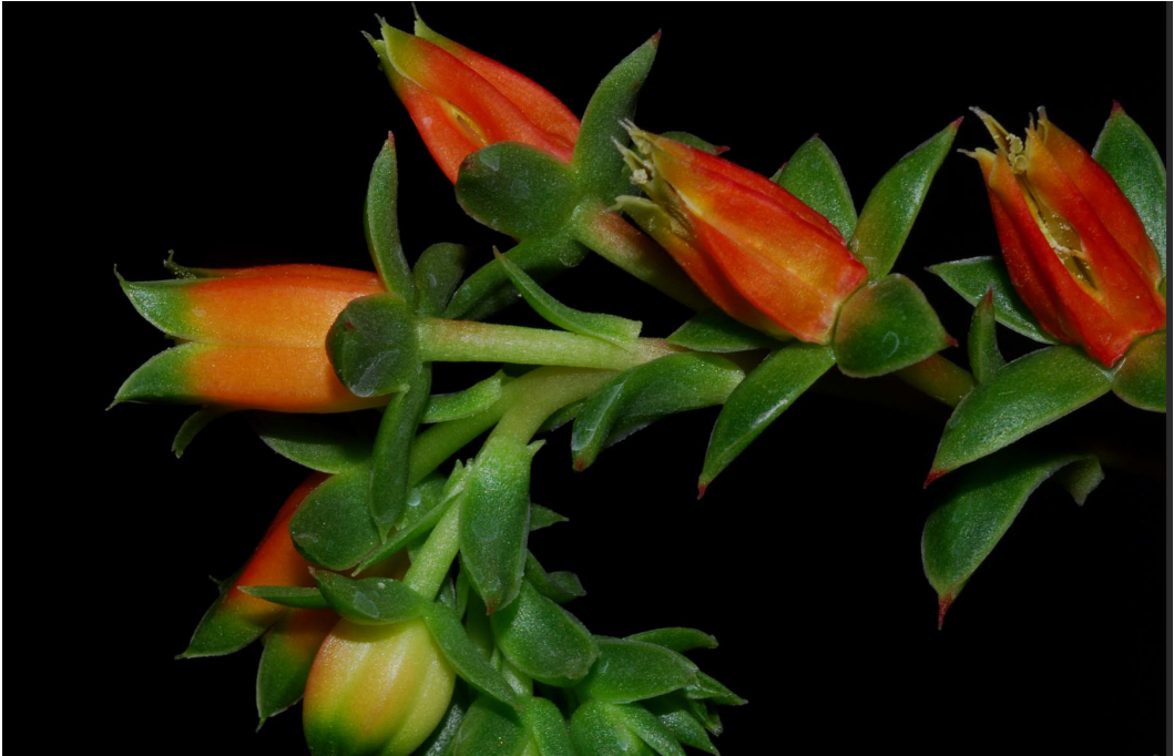
Figure 3. Inflorescence of Echeveria longissima subsp. brachyantha .